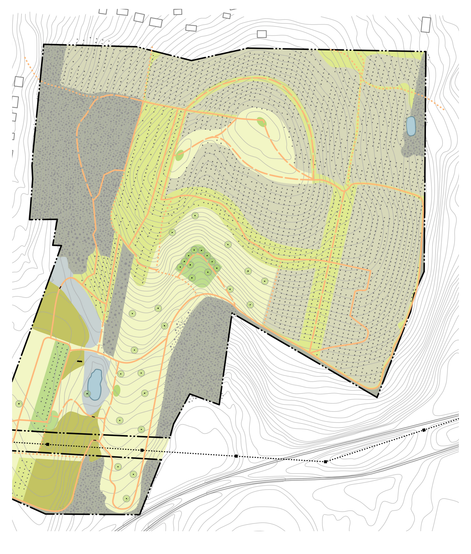
Proposed Character/Habitat Zones & Trails